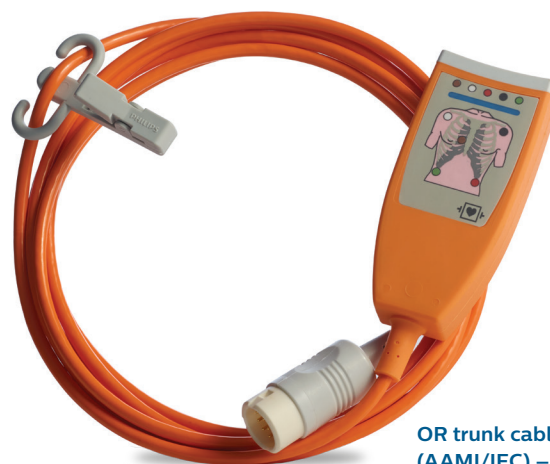
OR trunk cable 5-lead (AAMI/IEC) – 989803170181

Philips provides the only direct-connect, single-patient use lead set for the IntelliVue MX40, with no adapter required. This direct connection can result in time-saving efficiencies, enhanced patient comfort, and reduced accumulation of soil and liquids to further support your infection controls. Plus, the lightweight design is as easy for patients to wear as it is for clinicians to access. The companion MX40 trunk cable can facilitate fast-switching to stay with a patient as they move to a bedside monitor. The IntelliVue MX40 lead set is also available with a pulse oximetry sensor.