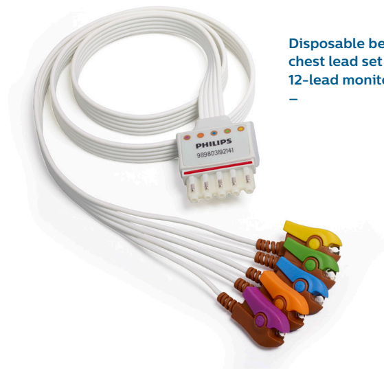
Disposable bedside chest lead set for 12-lead monitoring