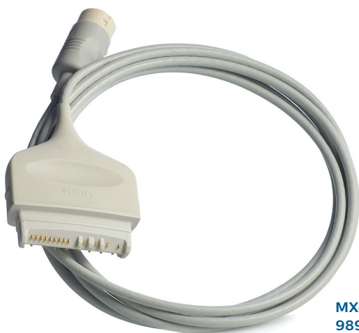
MX40 trunk cable (AAMI/IEC) – 989803172221

We're committed to providing ECG monitoring options that can work together in addressing the unique needs of your care environment and, most importantly, your patients. To learn more about disposable and reusable ECG monitoring accessories that can support your efforts to reduce cross-contamination and contain costs, visit philips.com/mysupplies or contact your local sales representative. If you're in the U.S., order with ease from philips.com/healthcarestore .